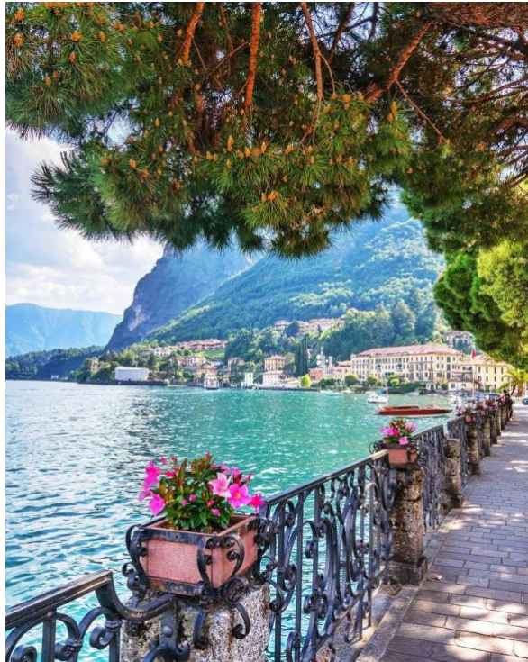
Menaggio - the next most famous and beautiful village with its stunning lakeside promenade and 'piazza'. Another great place for lunch whilst there is at 'La Trattoria Costantin'.