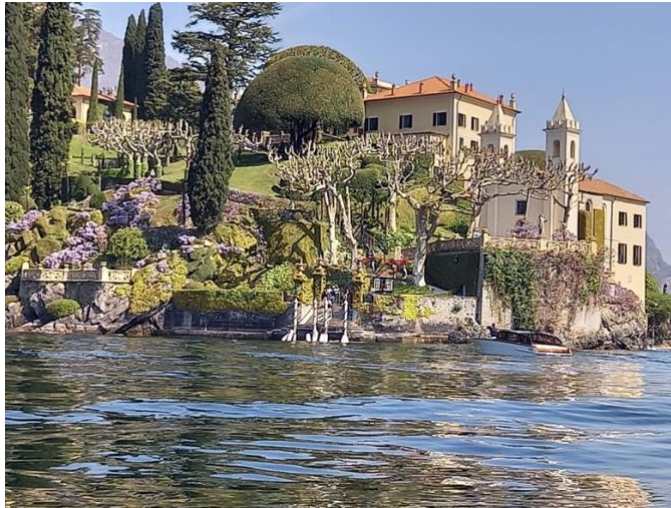
Villa Balbianello with scenes from Star Wars episode 2 and James Bond – Casino Royale filmed here