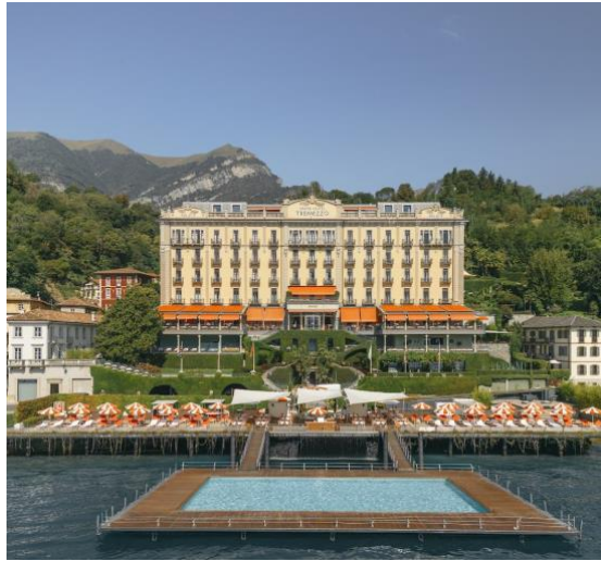
Grand Hotel Tremezzo

The Grand Hotel Tremezzo – your stay would not be complete unless you visit one of the top hotels in Europe. A must for a special occasion is drink and canapes at T Bar or T Beach.