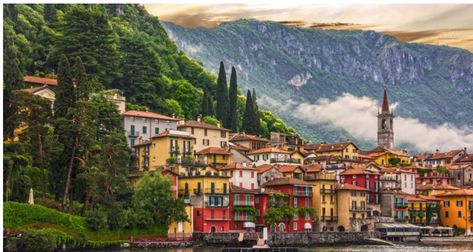
Varenna – On the eastern side of the lake, a lovely spot for lunch in one of the lakeside restaurants before exploring the village and villa monastero